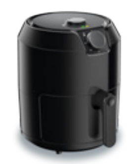
EASY FRY CLASSIC